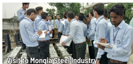
Visit to Mongia Steel Industry