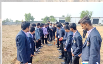
Mine Surveying Lab