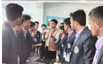
Mine Ventilation Lab