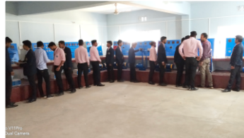
Electrical Machine-2 Lab