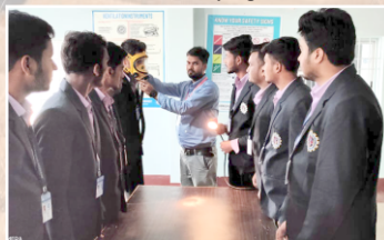
Mine Safety Lamp