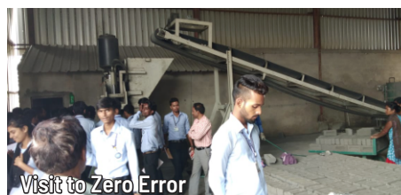
Visit to ZeroError