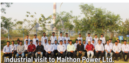
Industrial visit to Maithon Power Ltd.

Choice career for every student is the mission of T&P cell, to accomplish this the students undergo personality development programmes in communication & soft skills based on industry trends & establishing a close working relationship with leading business organizations. We leverage human capital for competitiveness by nurturing knowledge, entrepreneurship & creativity. We believe those strength that will help us successfully compete globally & explore emerging opportunities. We reward the will to succeed & the desire to compete with the best in the world.