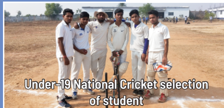
Under-19 National Cricket selection of student