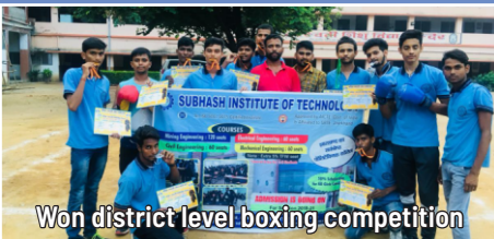
Won district level boxing competition