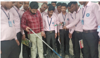
Engineering Mechanics Lab