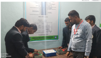
Digital Circuit & Microprocessor Lab