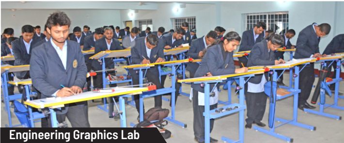
Engineering Graphics Lab