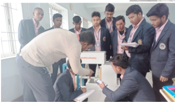
Fluid Mechanics & Hydraulics Machine Lab