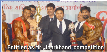
Entitled as Mr. Jharkhand competition