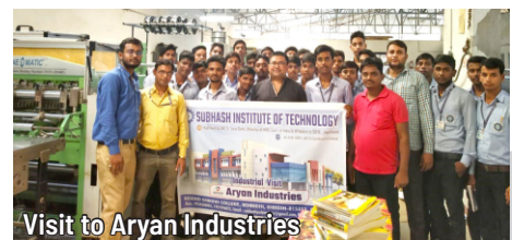
Visit to Aryan Industries