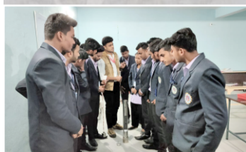
Rock Mechanics Lab