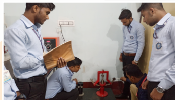
Theory of Machine Lab