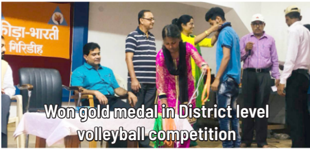
Won gold medal in District level volleyball competition