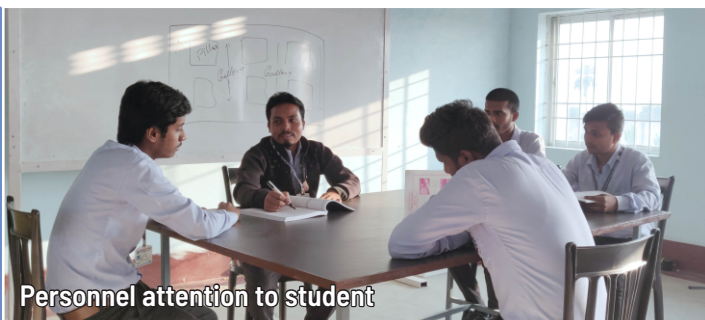
Personnel attention to student