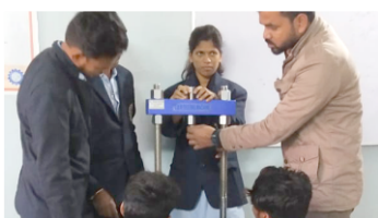
Concrete Technology Lab