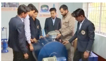
Building Material Lab