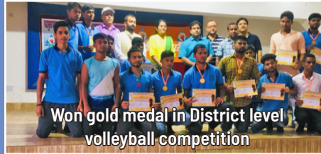
Won gold medal in District level volleyball competition