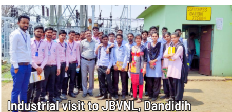
Industrial visit to JBVNL, Dandidih