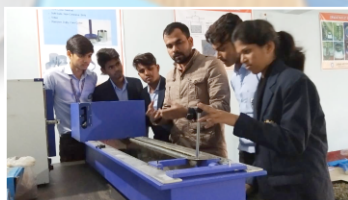
Transportation Engineering Lab