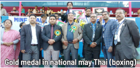
Gold medal in national may Thai (boxing)