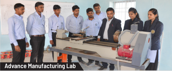
Advance Manufacturing Lab