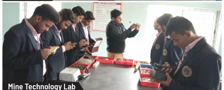
Mine Technology Lab