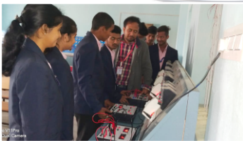
Electrical Engg Lab