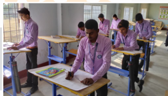
Machine Drawing Lab