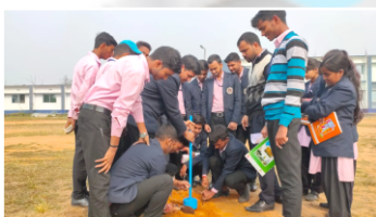
Geo Technical Lab