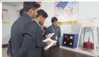
Thermal Engineering Lab