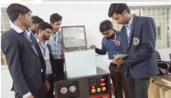
Power Engineering Lab