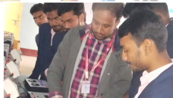
Network Theory Lab