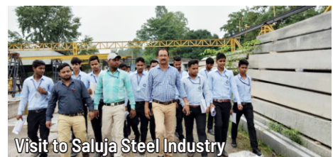
Visit to Saluja Steel Industry